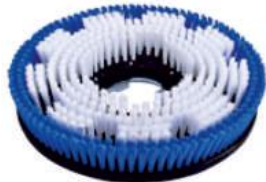
carpet cleaning brush