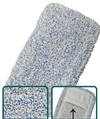
Special Cover 50/50