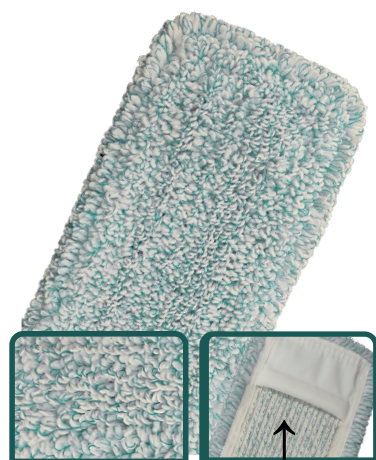
Special Cover 50/50