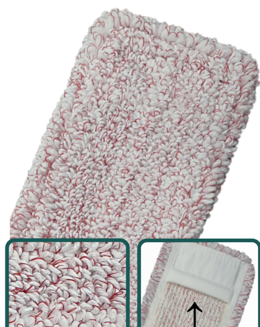
Special Cover 50/50