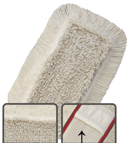
Special Cover sheet 50/50