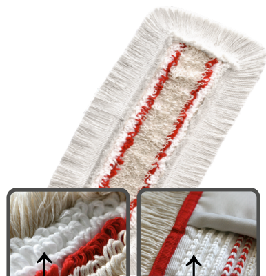
Polyester-Microfiber Special Cover sheet 50/50

When drying, 80 °C should not be exceeded.