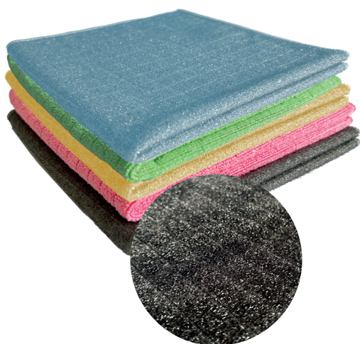
abrasive bristle side