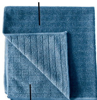
soft microfiber side