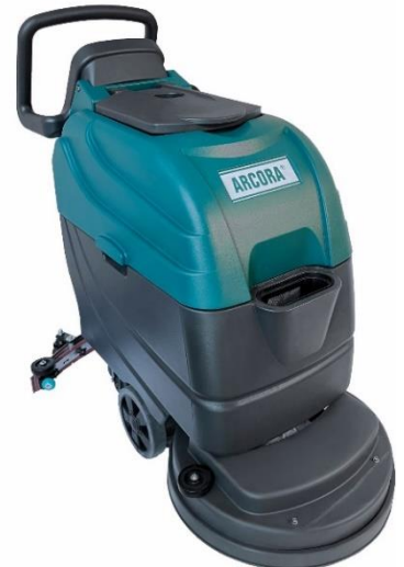
520BM/55L SCRUBBER DRYER MACHINE