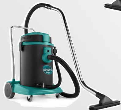
WD 50 PD