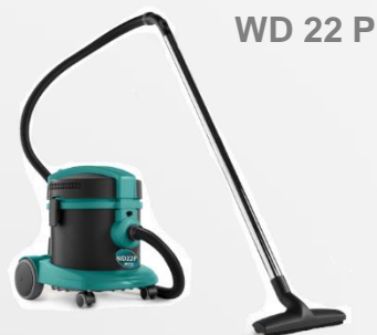
WD 22 P