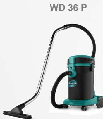
WD 36 P