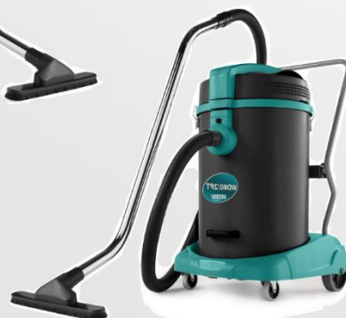
WD 80/2 PT

Powerful models for wet and dry applications for professional use with plastic containers in various designs.