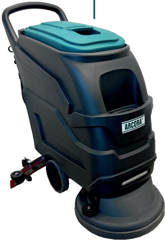
Dirt water tank

The compact walk-behind scrubber dryer is ideal for basic and maintenance cleaning, especially in heavily frequented areas such as supermarkets, offices and public facilities. Particularly suitable for confined areas. Characterised by flexibility, user-friendliness and outstanding cleaning performance. Surfaces are cleaned reliably, quickly and without leaving any residue.