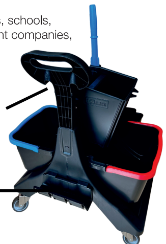
Side holder for mop frame