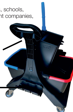
Side holder for mop frame